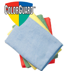
E810016,3,0,2 Supremo™ Microfiber Cloth