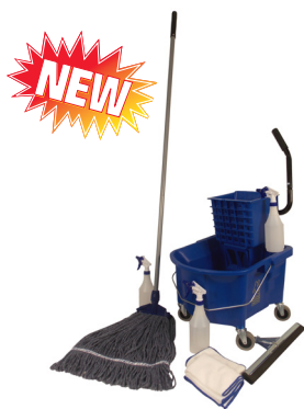
Bar Cleaning Value Pack