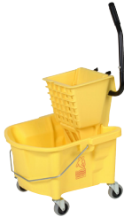
226-312YW Splash Guard™ Side-Press Combo Pack