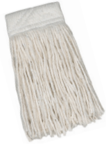
A937014 Choice™ Cut-End Mops

Everyone knows that customers prefer clean, shiny floors. Properly maintained floors are the best way to avoid slip and fall injuries. We have the most comprehensive product offering in the industry, with all the tools you need to keep your floor looking good and your customers impressed.