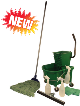
Kitchen Cleaning Value Pack