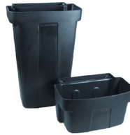
5811/58121 Silverware & Refuse Bins