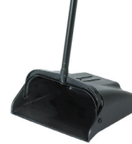
912BK Lobby Dust Pan