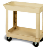
5800BE Utility Cart