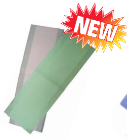
FFM10016 FastMop™ Microfiber Mops