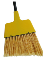
E507012 Angled Broom