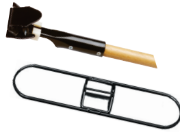
C801060 / C702024 Swivel Snap™ Handles Swivel Snap™ Frames