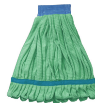
A10102 Microfiber Super Sorb Tube Mops