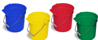
Huskee® 10qt. Bucket