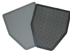
167-1/167-2 Kleen Mats - Urinal Mats