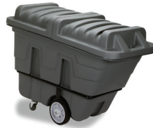
5843/5840 Tilt Truck & Cover