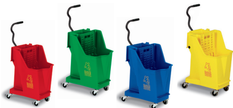
UniBody® Mopping System