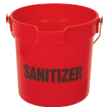
8110RDGM Preprinted Huskee® Bucket