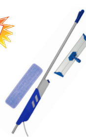
SYSH-5 ErgoFlo® Kit