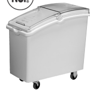
9321 Mobile Ingredient Bin