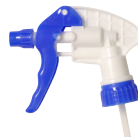
902BW7 Spray-Pro Sprayer