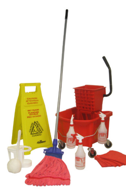
Restroom Value Pack

■ Dining / General Cleaning ■ Restroom ■ Specialty ■ Kitchen