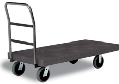
5880 Platform Trucks