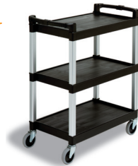
5810BK Service/Bussing Cart