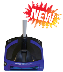
5328 Huskee® PowerWhisper™