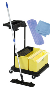
SYSK-1 ErgoWorx® Kit

Microfiber products offer many advantages over traditional cleaning methods. When used properly, microfiber significantly reduces the risk of cross contamination.