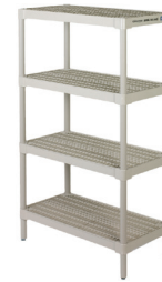
64850Y NSF® Ventilated Storage Shelf