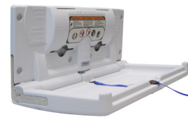
8252-H Diaper Changing Station - horizontal