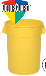
3200YW Huskee® Round

Only the strong survive here! These durable products stand the test of time and are an amazing value. Almost everything in your facility is moving constantly. We make moving things easy, without hurting your back, or your bottom line!