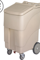
9720BE ConServ Ice Bin