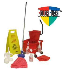
RRVP-1 Restroom Value Pack