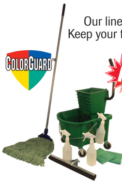
KCVF Kitchen Cleaning Value Pack

Our line of food storage products provides convenient and long-lasting solutions for managing large quantities of ingredients. Keep your food prep and dining areas clean and organized with these high-quality, effective tools - they are an unbeatable value!