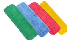
Super Pro II™ Microfiber Mops