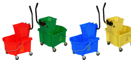
26qt. Splash Guard™ Side-Press Combo (Buckets & Wringers are also available separately)