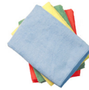
Supremo™ & Standard Microfiber Cloths