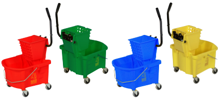
26qt. Splash Guard™ Side-Press Combo (Buckets & Wringers are also available separately)