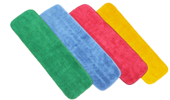
Super Pro II™ Microfiber Mops