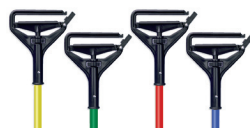
#94 Speed Change™ Mop Handles