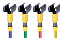
Super Jaws™ Mop Handles