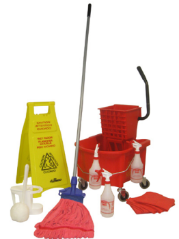
Restroom Value Pack

Items are available in a variety of sizes and colors - see chart on the back or go to www.continentalcommercialproducts.com for more information.