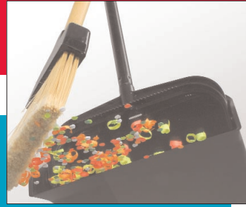
27 - 56 FLOOR CARE MAINTENANCE