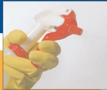
62 - 79 GENERAL CLEANING