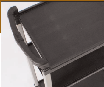
108-112 MATERIAL HANDLING