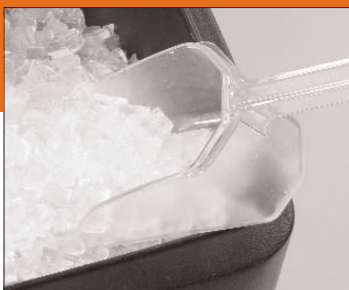
122-130 FOOD SERVICE EQUIPMENT