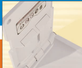
113-121 REST ROOM PRODUCTS