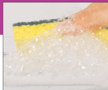
131-148 FOOD SERVICE SUPPLIES