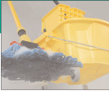
3 - 26 MOPPING EQUIPMENT